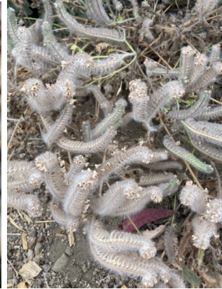
Lacy Phacelia (Phacelia tanacetifolia)