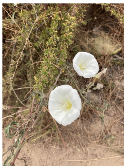
CA Morning Glory